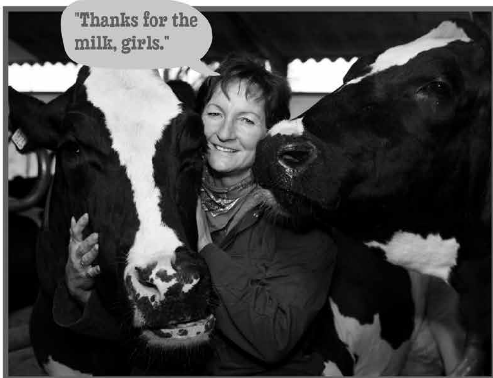
Dairy farmers care for their land, animals, families and community