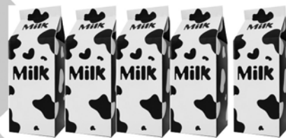
5 litres of milk

Cheese contains many of the nutrients found in milk. Why? Because it's made from milk! It takes a lot of milk to produce a package of cheese.