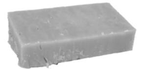
454 grams of cheese